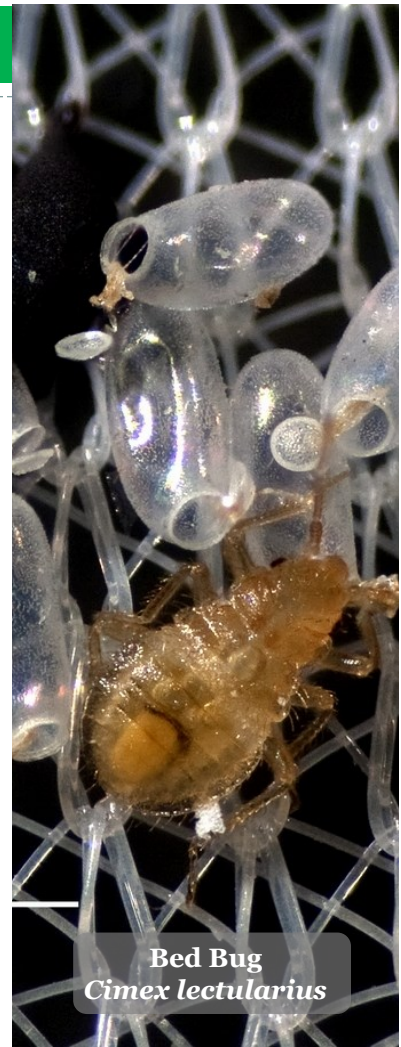
Bed Bug Cimex lectularius

“Greetings, fellow association members! I am privileged to serve as your president this year and am happy to be a part of this initial GNOPCA newsletter. Its purpose is to keep you informed about a host of industry-related issues, changes, proposals, etc. Please, stay involved in the association! The officers and board members welcome ANY feedback you may have during the year. Stay tuned for upcoming news on guest speakers, recertifications, webinars, and other association activities that will make you proud to be a member.”